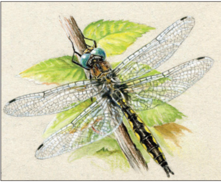
Beaverpond Baskettail