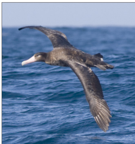
Short-tailed Albatross, observed at Cordell Bank on September 16.

On the 5th, a Yellow-billed Cuckoo flew out of Pescadero Cr. at Phipp's County Store, SM (RT, LB). On the 19th, a Chimney