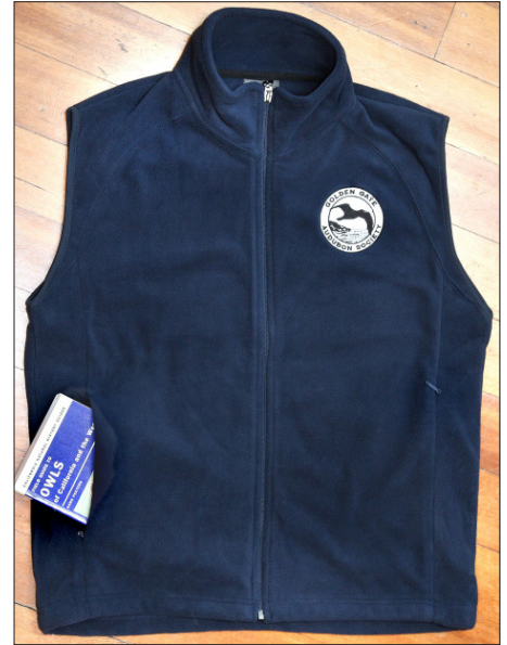
GGA's new fleece vest.

The Nature Store is located at the GGA office, 2530 San Pablo Avenue, Berkeley. Select merchandise is also available at our Berkeley Speaker Series and Christmas Bird Count events. Golden Gate members get a 10 percent discount on all purchases—and remember that all proceeds go directly to support GGA programs.