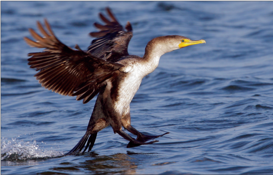
Double-crested Cormorant, a species that nests at Lake Merced in San Francisco and Lake Merritt in Oakland, two sites that GGA worked to protect early in its history.