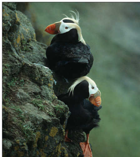
U.S. Fish and Wildlife Service

More breeding seabirds flock to the Farallon Islands than any other spot on the continental west coast, and California's shores are dotted with hotspots where seabirds congregate to breed and feed. Seabirds and the many marine mammals drawn to such locations depend on their rich web of ocean life. But like other ocean systems, ours faces a variety of threats. In 1999, the state enacted the landmark Marine Life Protection Act to help address those threats, embarking on the rocky road to designing science-based networks of protected areas in the state's ocean waters. Now, 10 years later, that inclusive process has created a necklace of protected biological gems along the central coast, much like our system of parks and refuges on land. Join Karen Garrison for a tour of the amazing ocean life in our backyard and the challenges of protecting that legacy for the future.