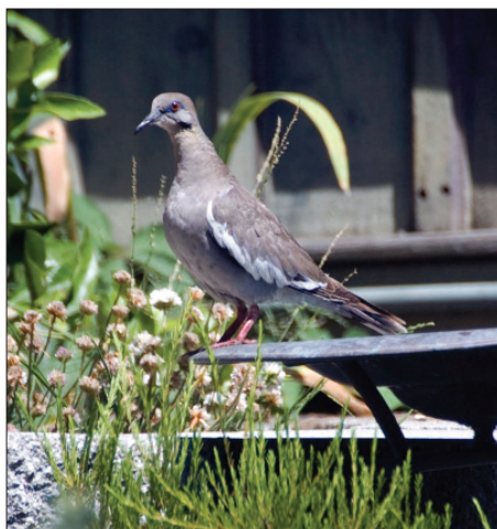
White-winged Dove, first observed in Pt. Richmond on June 26.