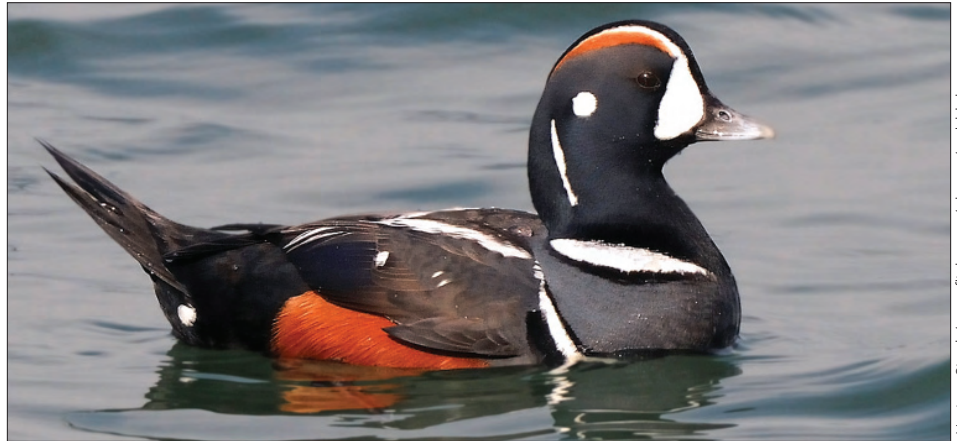
Harlequin Duck, photographed on February 13 at Point Richmond.

A remarkable 6 Iceland Gull ( Larus glaucooides ) reports were filed this period, starting with a 2nd cycle bird found bathing at Deniston Cr. mouth in Pillar Pt. Harbor, SM, on Feb. 4 (AJ, PA, DB); an adult, tentatively ID'd among the Larid throngs following the herring run at Miller Knox RS, CC, on Feb. 13 (BR; ES); probably a different 2nd cycle bird at Venice Beach, Half Moon Bay, SM, on Feb. 24 (AJ); an adult bird at a NAP Valley College duck pond, NAP, on Feb. 27 (MBe); a returning 2nd cycle bird at Ogier Ponds, SCL, Mar. 5–10 (SR); and finally a 1st cycle individual at Sutro Baths, SF, on Mar. 7 (BF). The number of reports is particularly noteworthy considering that the CBRC has reviewed only 21 reports and accepted only two state records, attributable to the notorious challenge of distinguishing Iceland from Thayer's Gull, which shows up regularly on the West Coast.