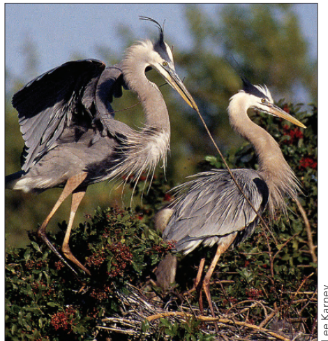
Great Blue Herons at nest.